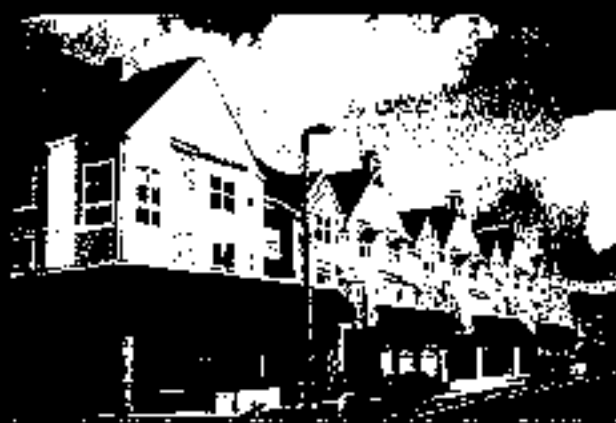
Mixed-use buildings in Redmond, WA

Live/work zoning codes support artists and micro enterprises by providing small adaptable spaces for service or retail activity within a residential project. Mixed use and live/work codes generally focus on development in already urbanized areas. Some codes attempt to protect an existing mixed-use area from incompatible auto-oriented development. Others aim to intensify and diversify uses in an already developed area, for example, transforming a conventional suburban, single-use commercial environment to a more walkable, 24-hour district with residential uses.