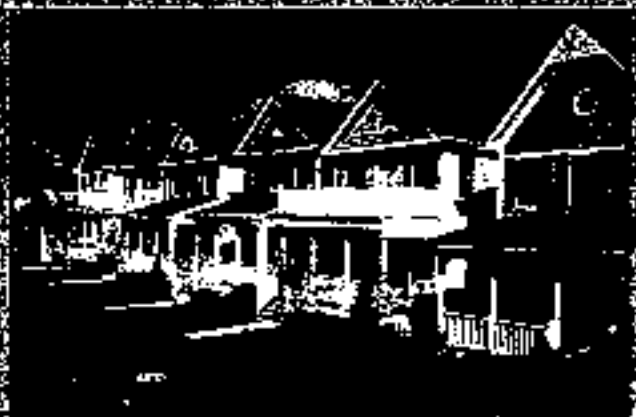
A traditional neighborhood in Kentlands, MD.

T raditional Neighborhood Development (TND) refers to a subset of development that was practiced throughout America and is still found in older neighborhoods built before