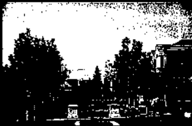
Townhomes at Winston Station in Mountain View, CA

Seattle, WA is using a station area interim overlay district to transition to transit-supportive uses within 1/4 mile of proposed light rail stations. The code has two simple provisions to protect the opportunity for more intense land uses once light rail arrives: First, new uses such as warehouses, heavy commercial and auto sales that are not transit supportive are prohibited. Second, on an interim basis, the parking standard of the neighborhood commercial zones, which are more restrictive, will apply.